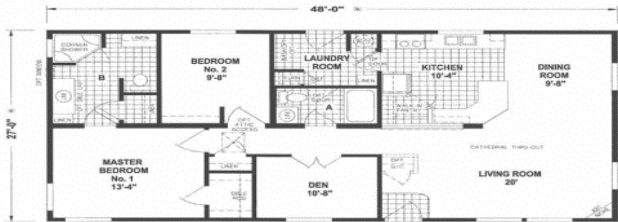
1227CTM/4828 (1,296 SQ. FT.) 2BEDROOM - 2BATHS - CATHEDRAL THRU-OUT