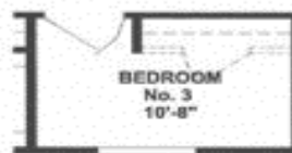
OPTION 3RD BEDROOM