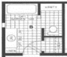
OPTION MASTER BATH