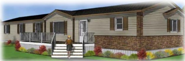
Single Section Homes

They are available in widths of 12', 14' and 16'