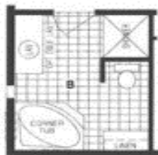
OPTION CORNER TUB BATH