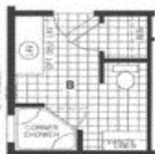
OPTION CORNER SHOWER BATH