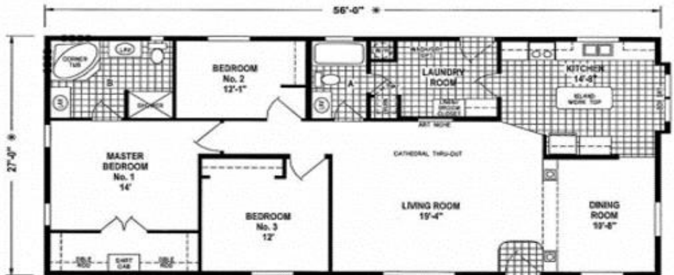
1224CTM/5628 (1,519 SQ. FT.) 3BEDROOM - 2BATHS - CATHEDRAL THRU-OUT