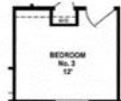
OPTION GUEST CLOSET